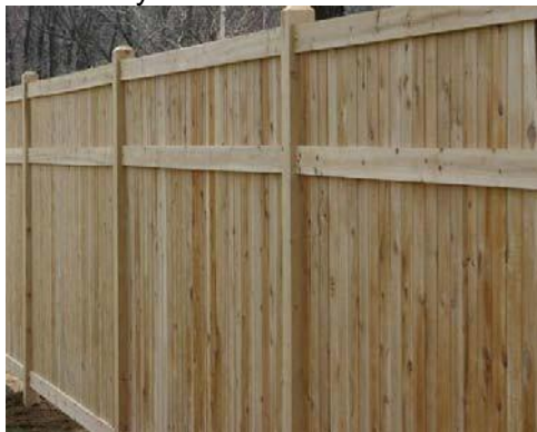
6' wood Straight Framed with Caps