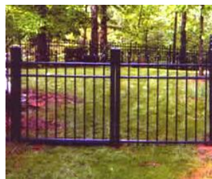
4' Wrought Iron/Aluminum